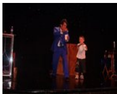
Excalibur - Las Vegas

Greener Delta is a collaborative effort between Delta Township, Grand Ledge Public Schools, Waverly Community Schools and Lansing Community College.