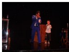
Excalibur - Las Vegas

Greener Delta is a collaborative effort between Delta Township, Grand Ledge Public Schools, Waverly Community Schools and Lansing Community College.