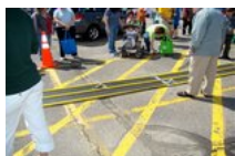
Students participating in the solar car races. At the 2009 event.